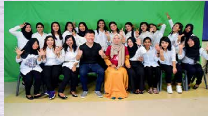
Basic English Class