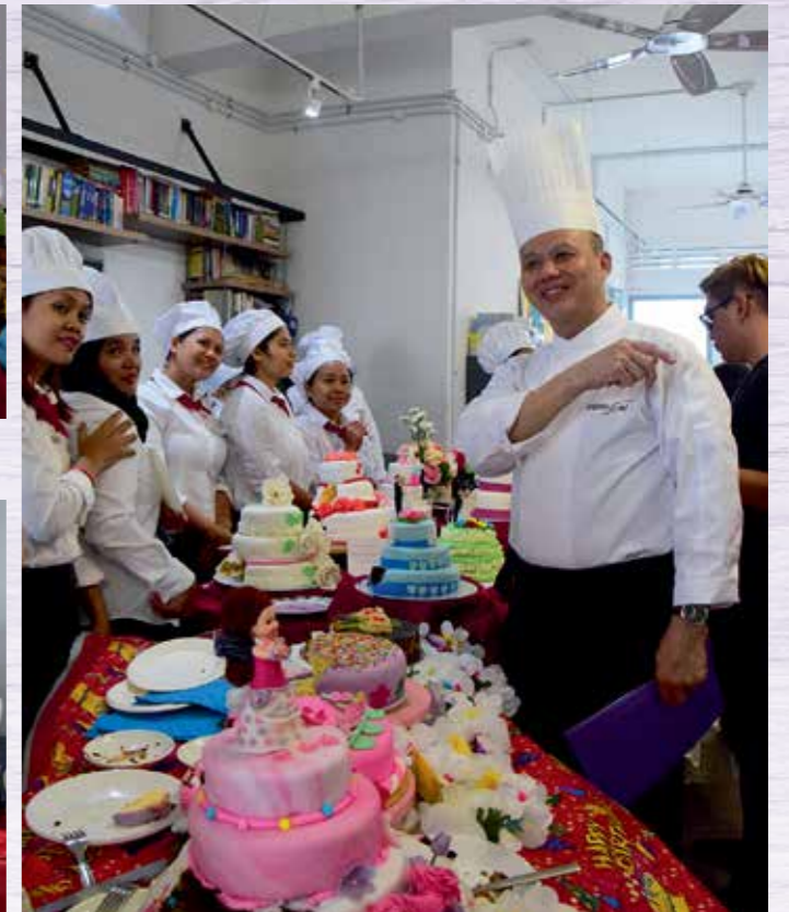
Advanced Baking Presentation