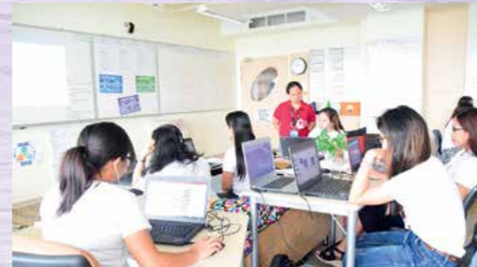
Basic Computer Morning