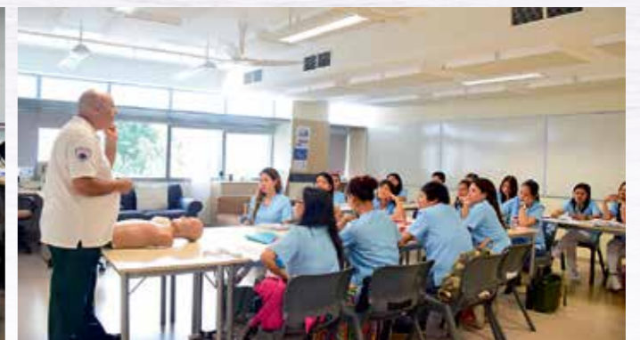
Nursing Aide Class