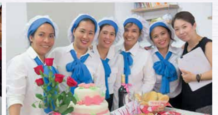
Basic Baking Presentation