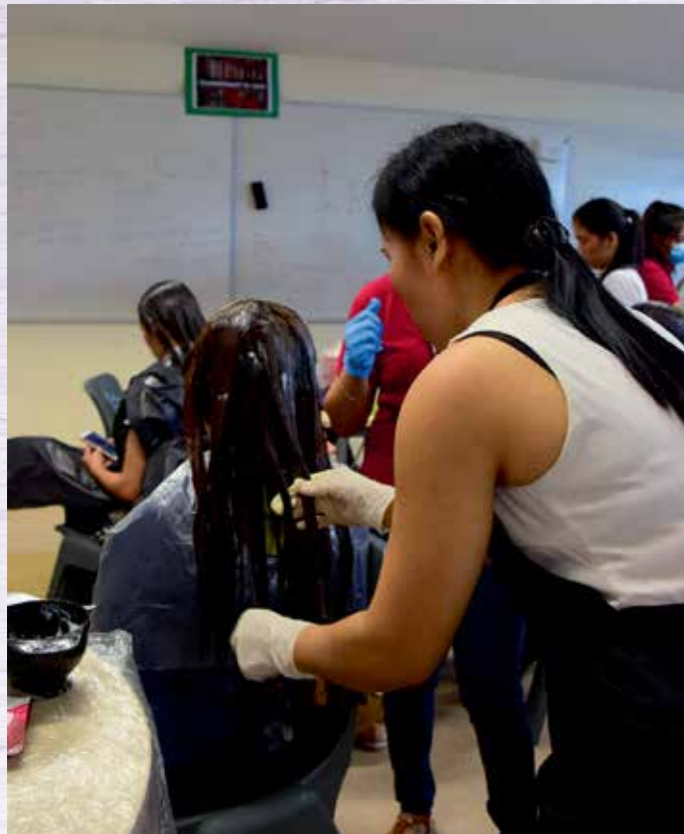
Advanced Cosmetology Class