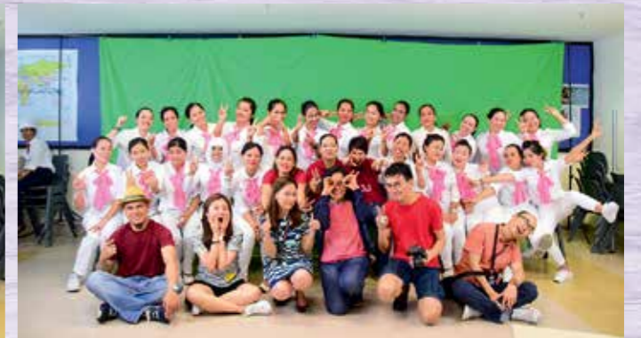
Advanced Caregiver Class