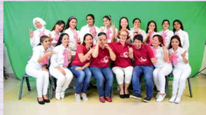
Cooking Class ??? same image as childcare?