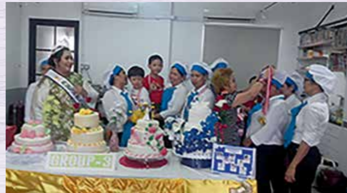
Basic Baking Presentation