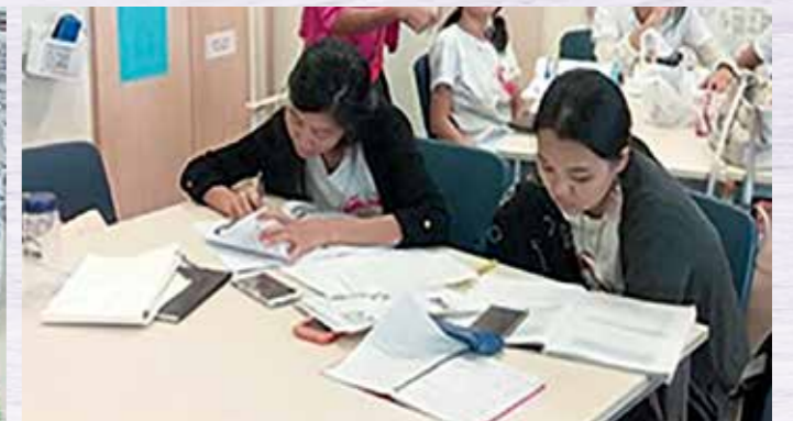
Intermediate English Class