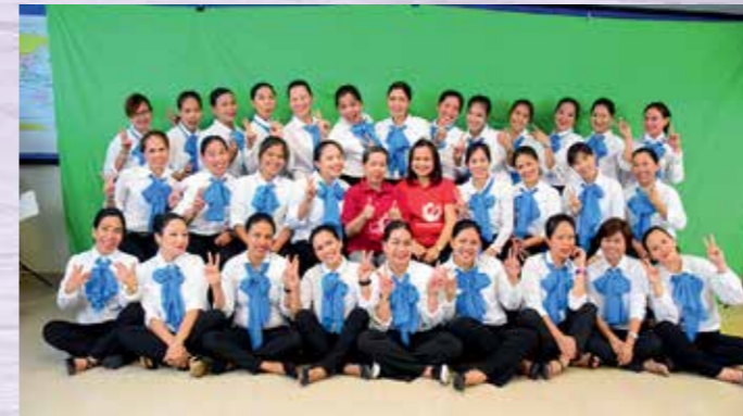
Basic Baking Class