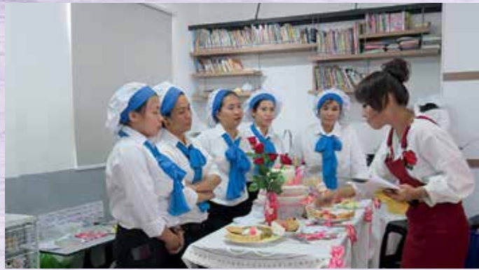
Basic Baking Presentation