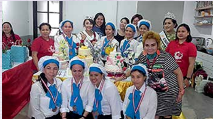
Basic Baking Presentation