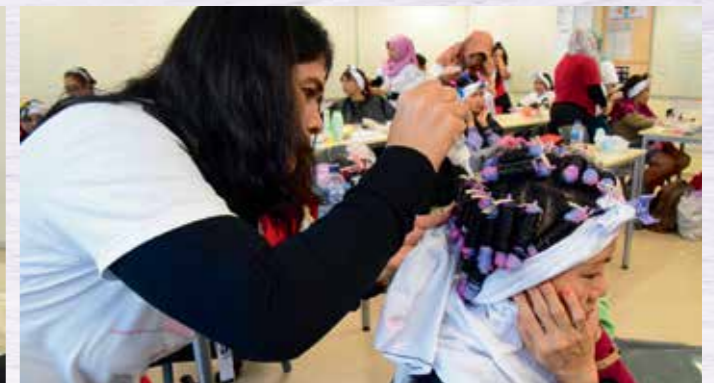
Basic Hairdressing Class