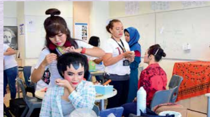
Javanese bridal Styling