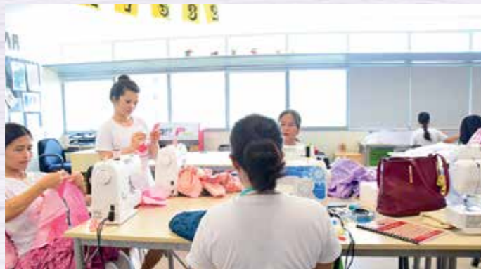
Basic Dressmaking Class