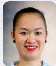
Sweden F. Dadivas