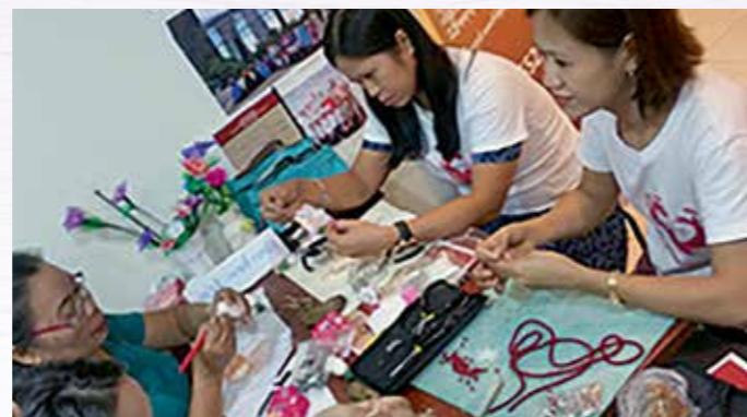
Jewelry and Arts Crafts