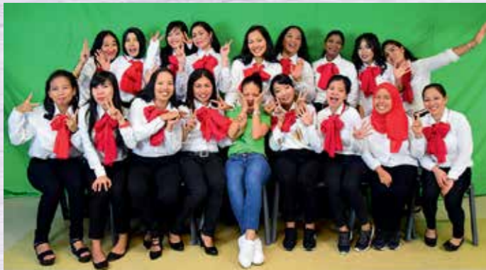
Basic Computer Class Morning