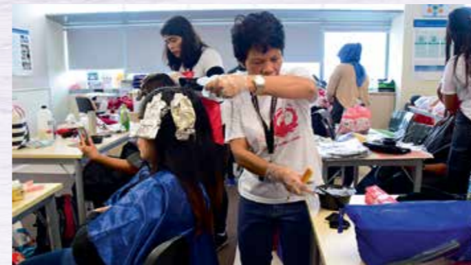
Advanced Hair Dressing Class