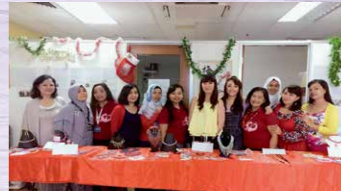
Jewelry Making / Arts & Crafts