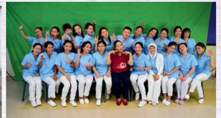
Nursing Aide Class