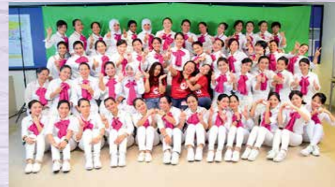
Basic Elderly Caregiver Class