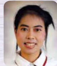
Chit Chit Two