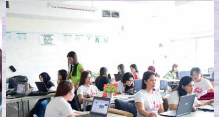
Basic Computer Morning