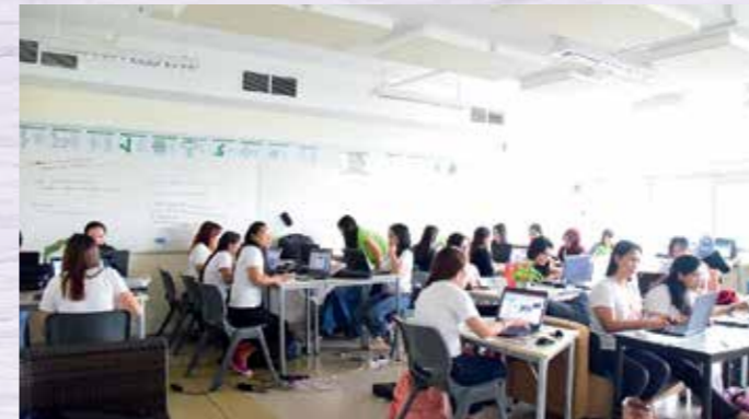
Basic Computer Morning