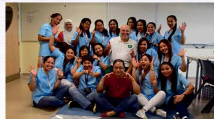
Nursing Aide Class