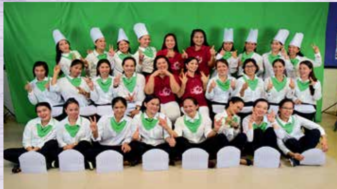
Basic Baking Class