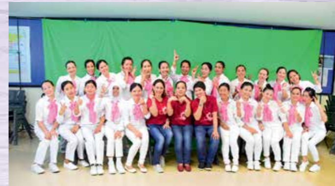
Advanced Caregiver Class