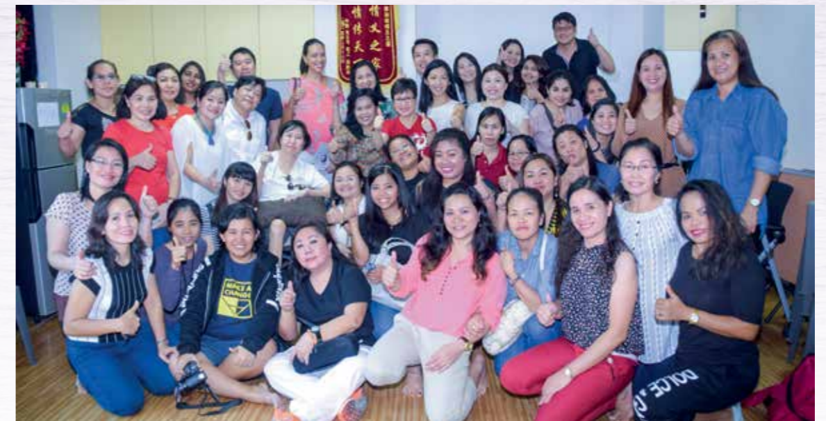
Board member and staff