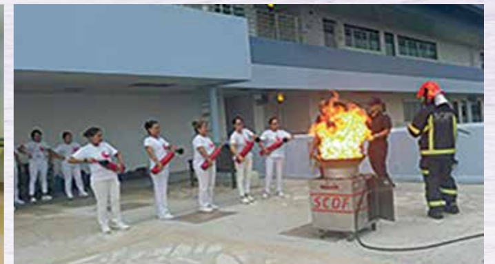
Basic Elderly Caregiver