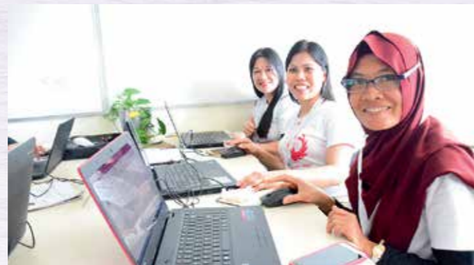
Basic Computer Morning