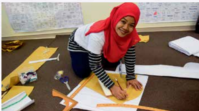
Basic Dressmaking Class