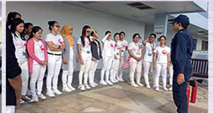
Basic Elderly Caregiver Class