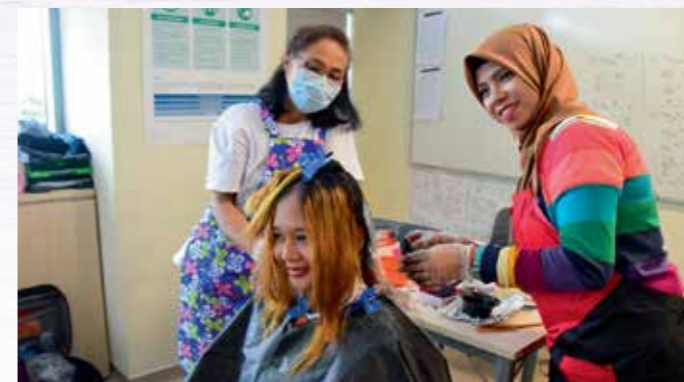
Advanced Hair Dressing