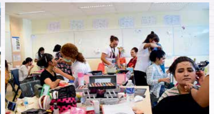
Javanesse Bridal Style