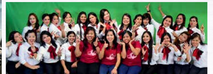
Advanced Cosmetology Class