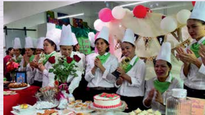
Basic Baking Class