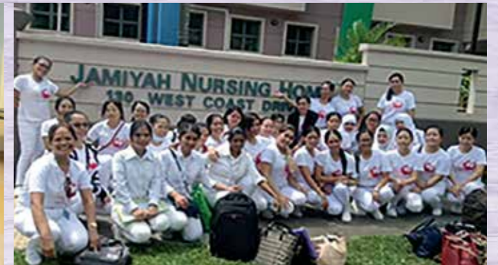
Basic Elderly Caregiver Class