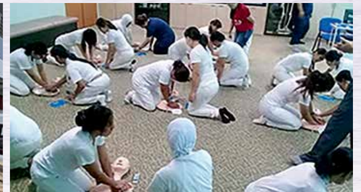
Basic Elderly Caregiver Class