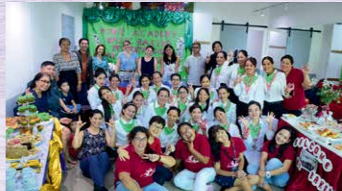
Basic Baking Class