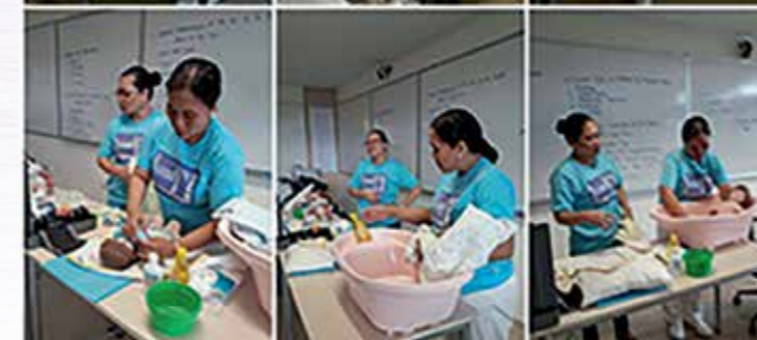
Advanced Caregiver Class