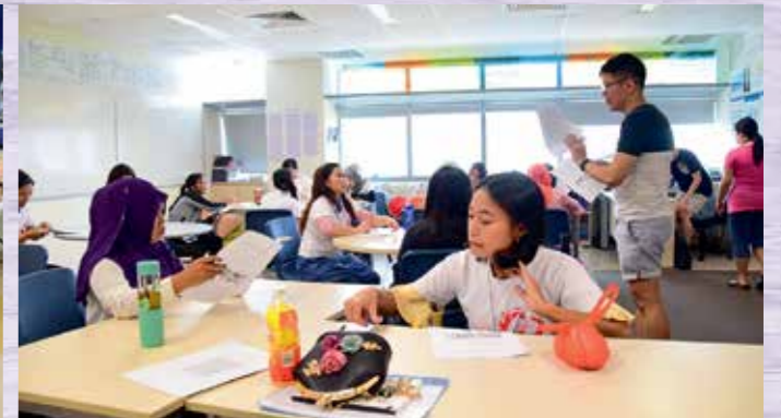
Basic English Class