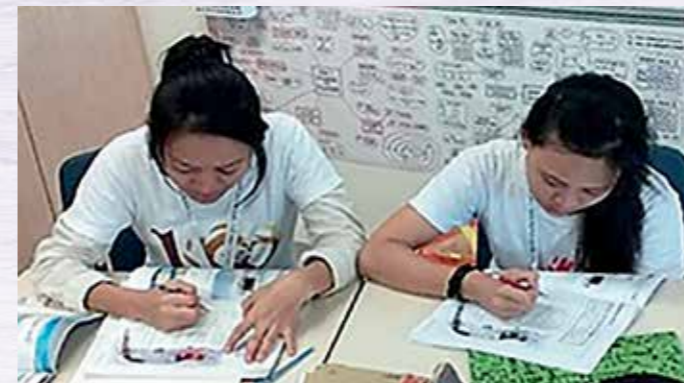
Intermediate English Class