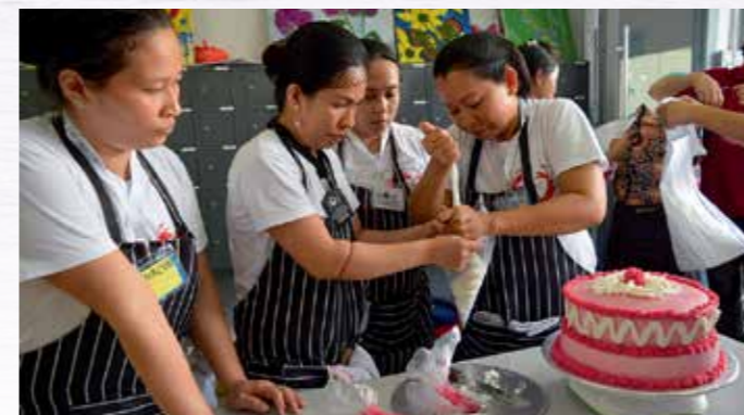
Basic Baking Class