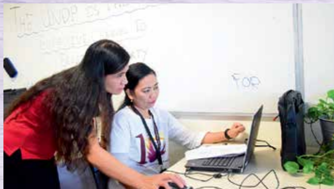
Intermediate Computer Class