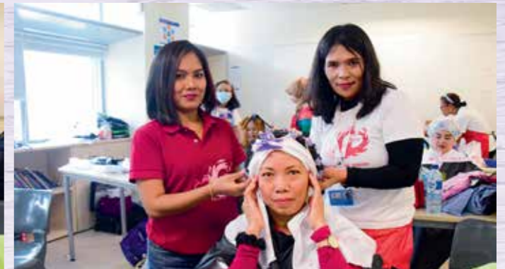
Basic Hairdressing Class