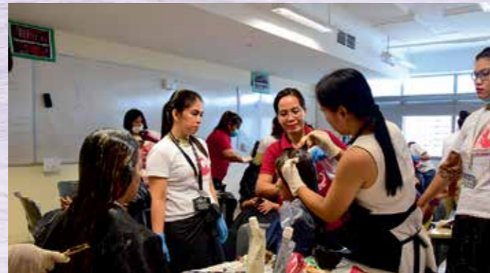
Advanced Cosmetology Class