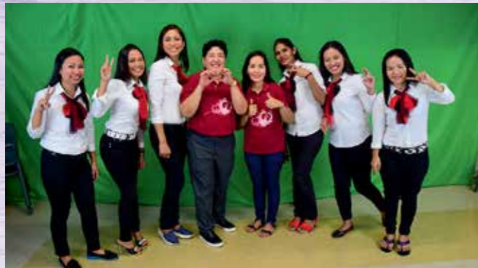
Cosmetology Practicum Class