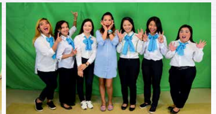
Basic English Class