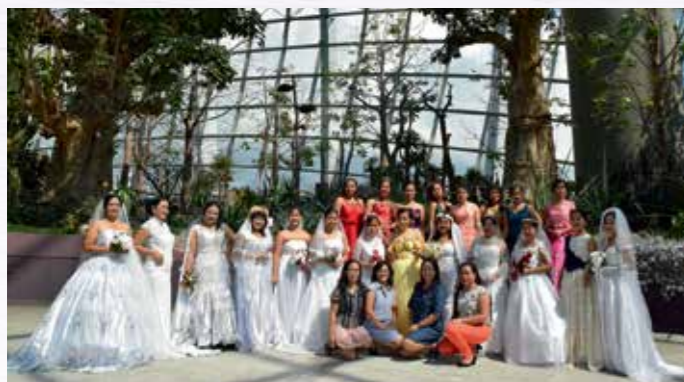
Basic Dressmaking / Tailoring