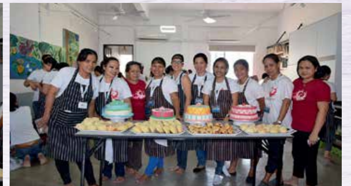
Basic Baking Class