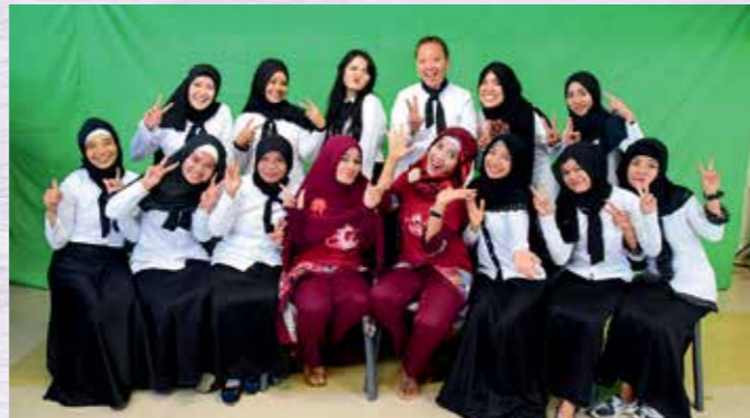
Basic Dressmaking Class