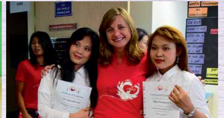
Intermediate English Class