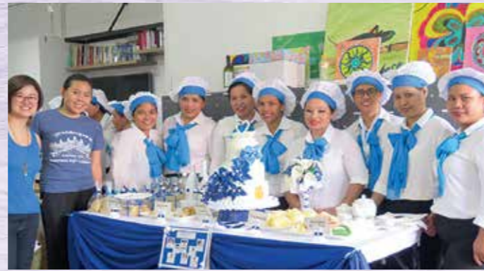
Basic Baking Presentation