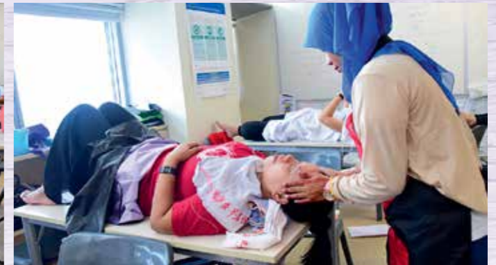
Advanced Hair Dressing Class