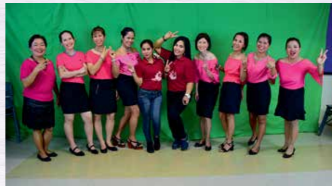
Jewelry and Arts Crafts