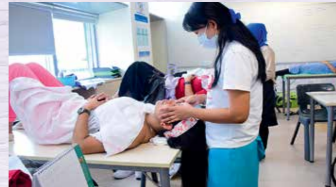
Advanced Hair Dressing Class