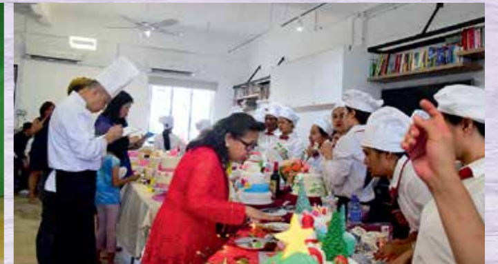
Advanced Baking Presentation