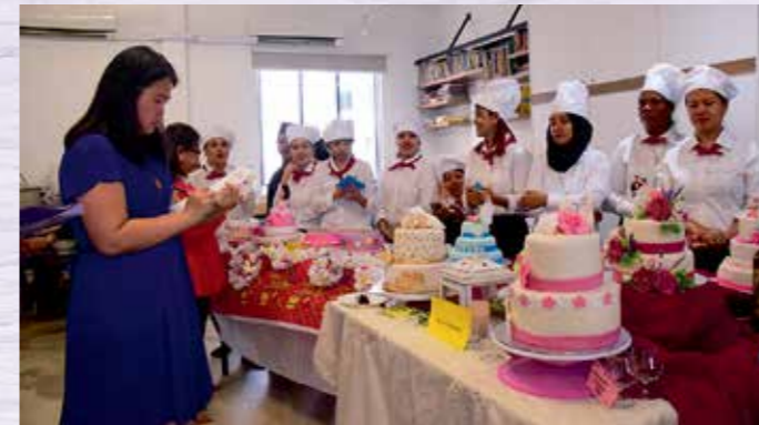
Advanced Baking Presentation