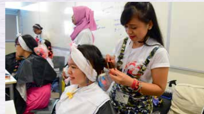
Basic Hairdressing Class