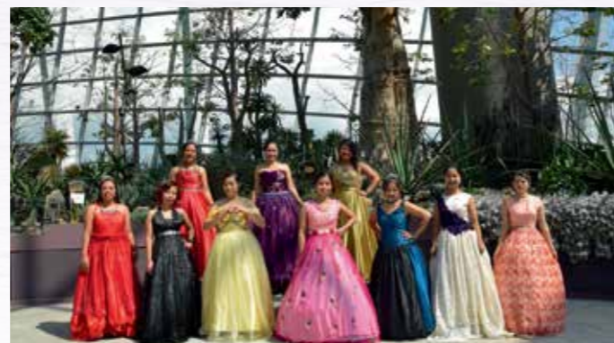
Basic Dressmaking / Tailoring