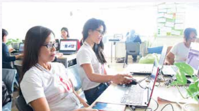
Basic Computer Morning