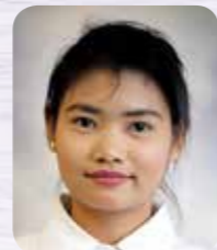
Shine Latt War