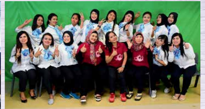
Basic Hair Dressing Class