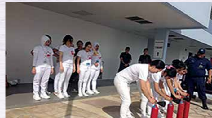
Basic Elderly Caregiver Class