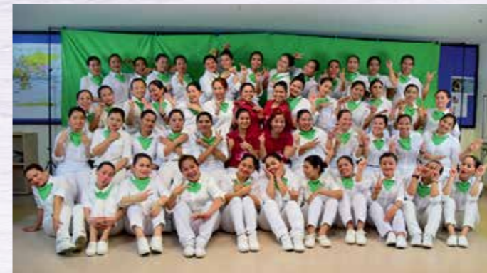
Basic Elderly Caregiver