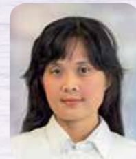
Naw September Paw