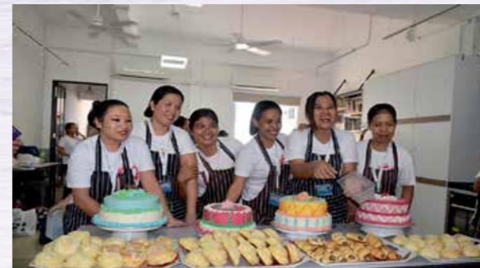
Basic Baking Class