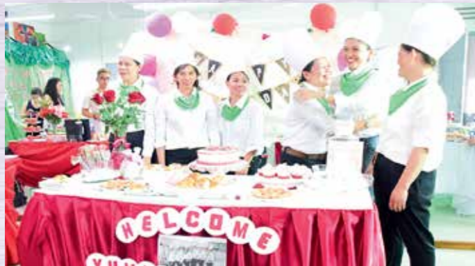
Basic Baking Class