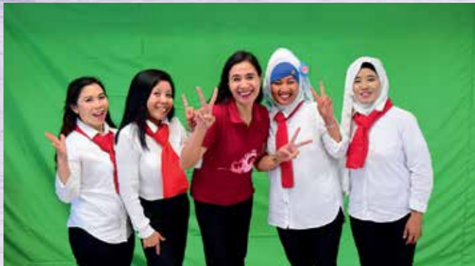
Basic Computer Class Afternoon