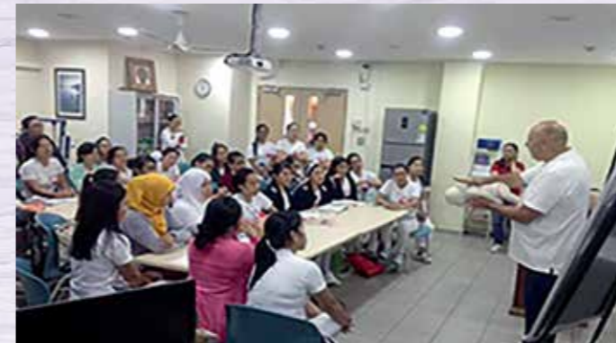
Basic Elderly Caregiver Class