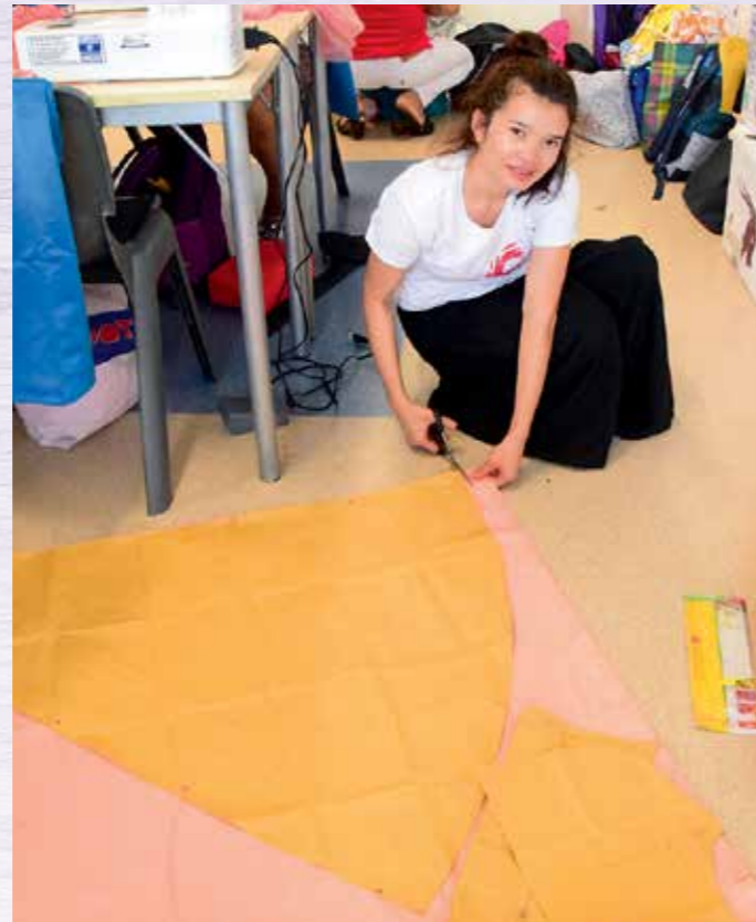
Basic Dressmaking Class