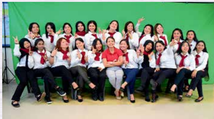
Basic Computer Morning