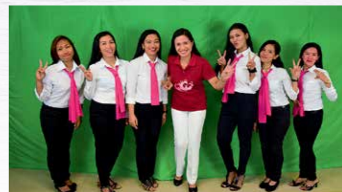
Intermediate Computer Class