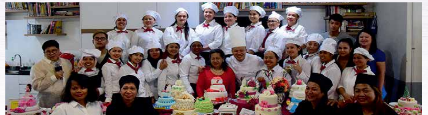
Advanced Baking Presentation