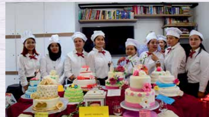
Advanced Baking Presentation