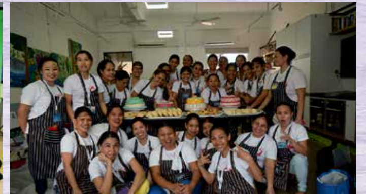
Basic Baking Class