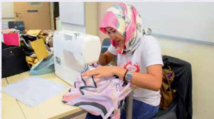
Basic Dressmaking Class