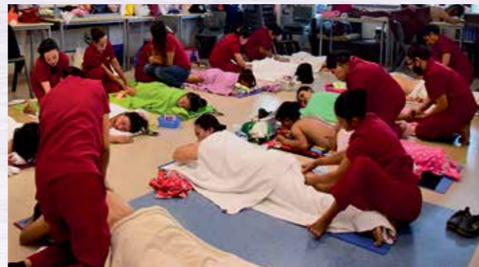
Basic Aromatherapy Class