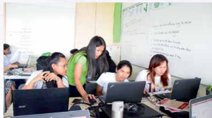
Basic Computer Morning