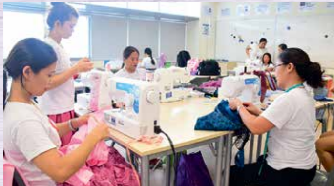
Basic Dressmaking Class