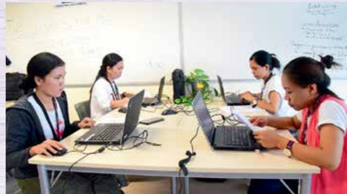
Intermediate Computer Class