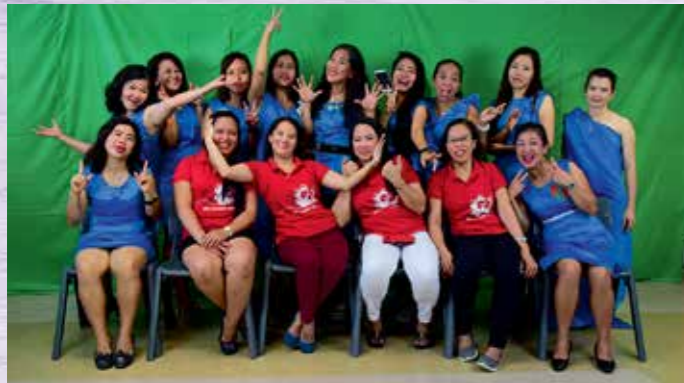
Basic Dressmaking Class