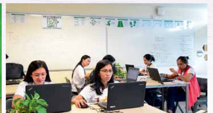
Intermediate Computer Class