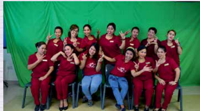
Basic Aromatherapy Class