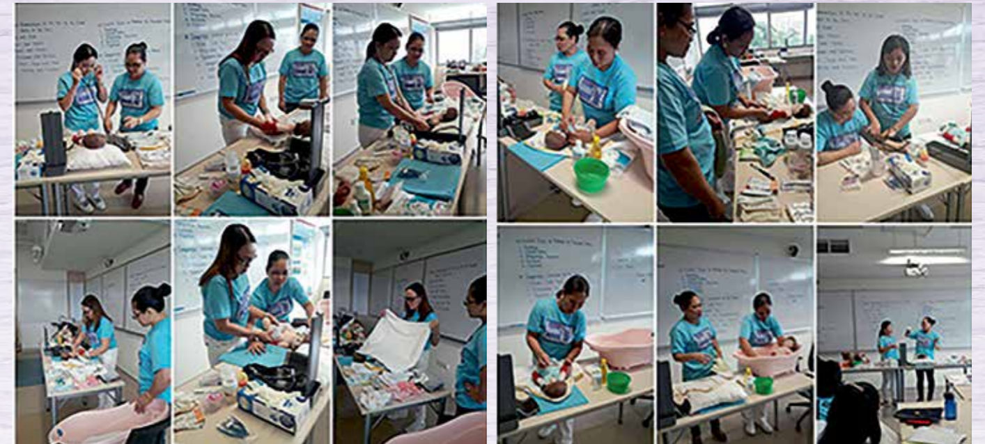
Advanced Caregiver Class