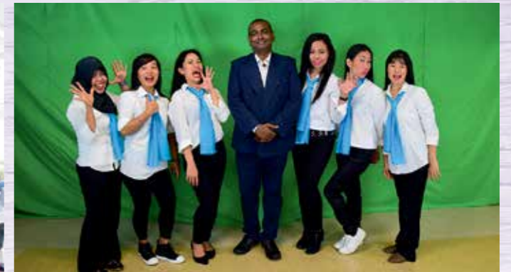
Basic Computer Afternoon