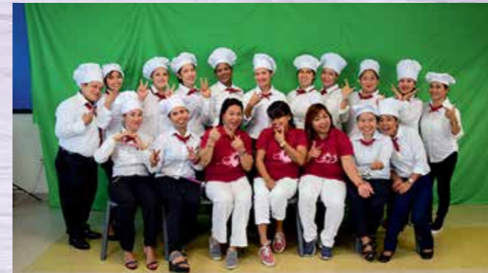
Advanced Baking Class