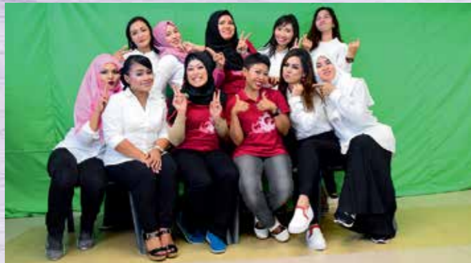
Javanese bridal Styling