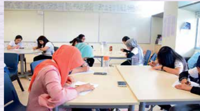
Basic English Class