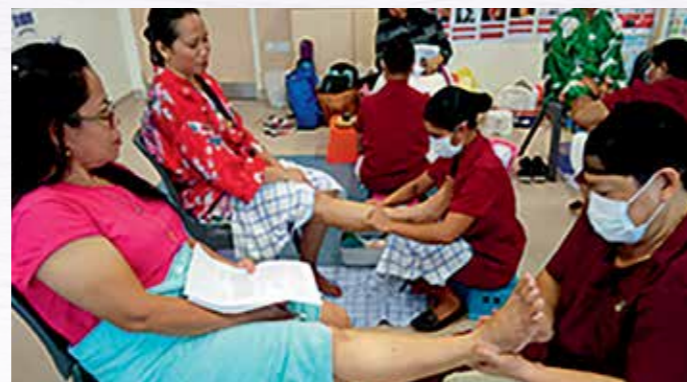
Basic Aromatherapy Class