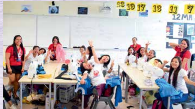
Basic Dressmaking Class