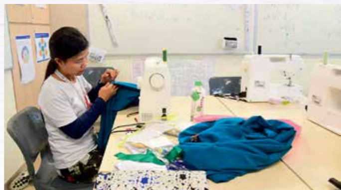
Basic Dressmaking Class