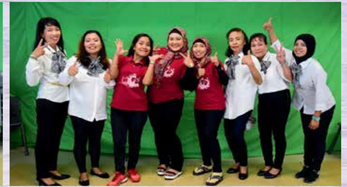
Advanced Hair Dressing Class