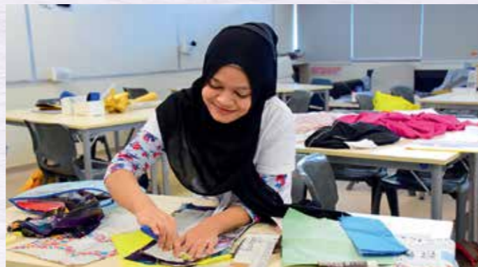
Basic Dressmaking Class