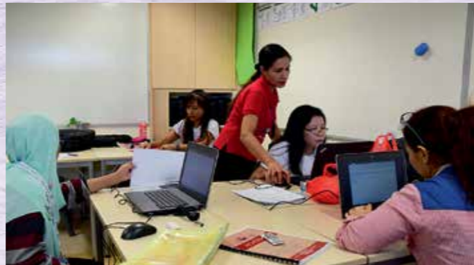
Basic Computer Class Afternoon