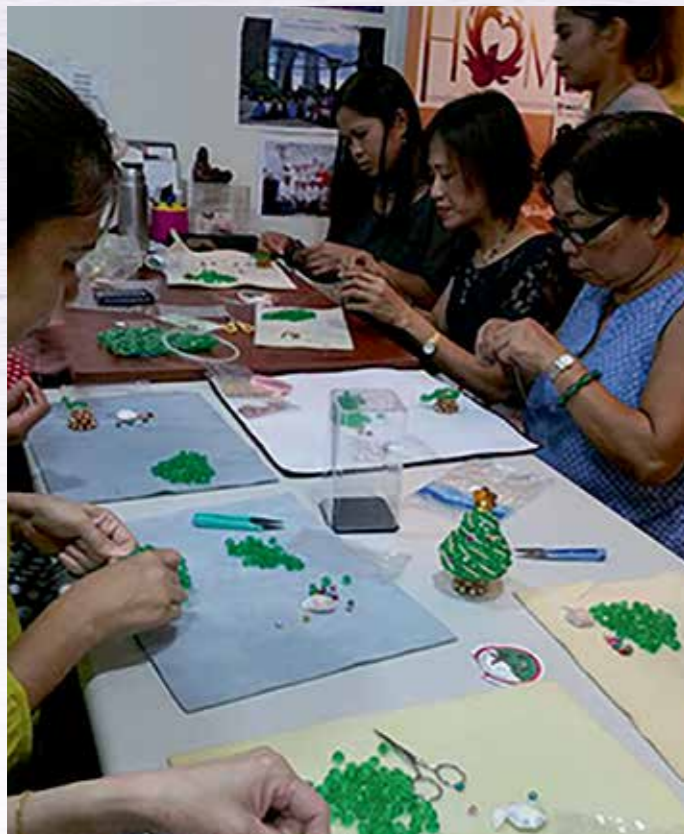
Jewelry and Arts Crafts