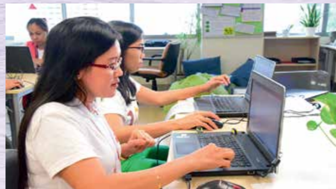
Intermediate Computer Class