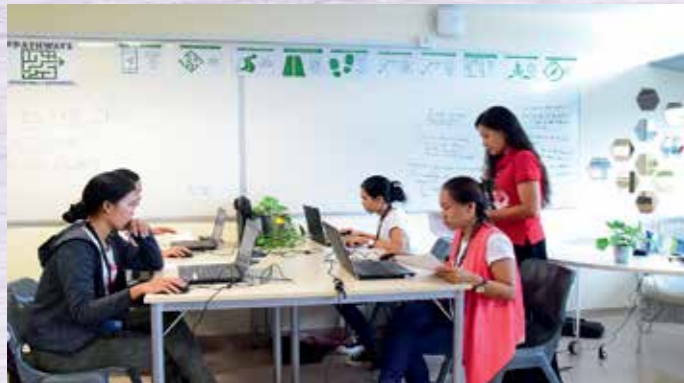
Intermediate Computer Class