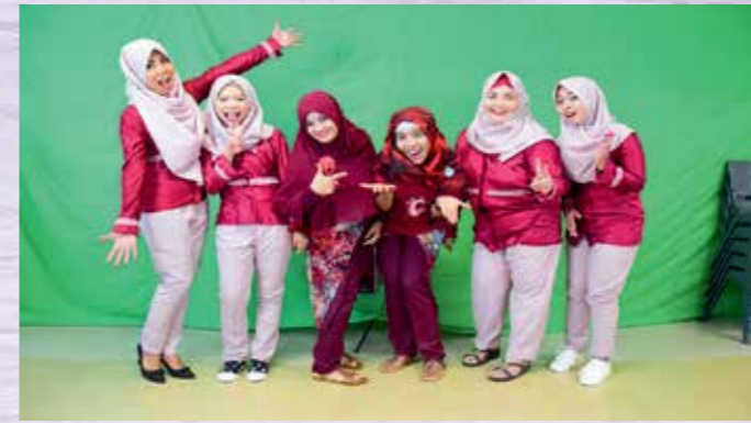
Advanced Dressmaking Class